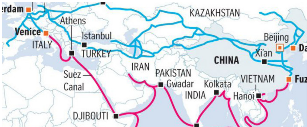
Figure 3. Belt and Road Initiative (BRI) Map